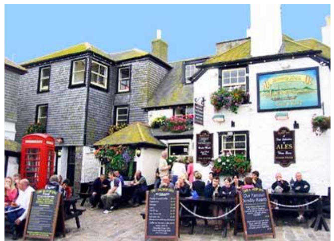
Sloop Inn, St Ives