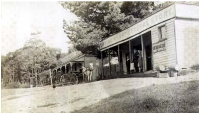
Roberts General Store and PO, Springmount