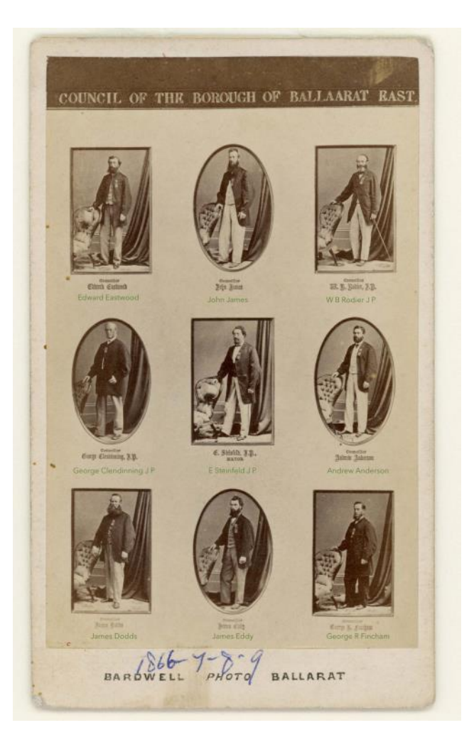
Ballarat Historical Society Collection Object ID 183.81a

Trove The Ballarat Star, Wednesday 25 December 1867. Page 2.News and Notes.